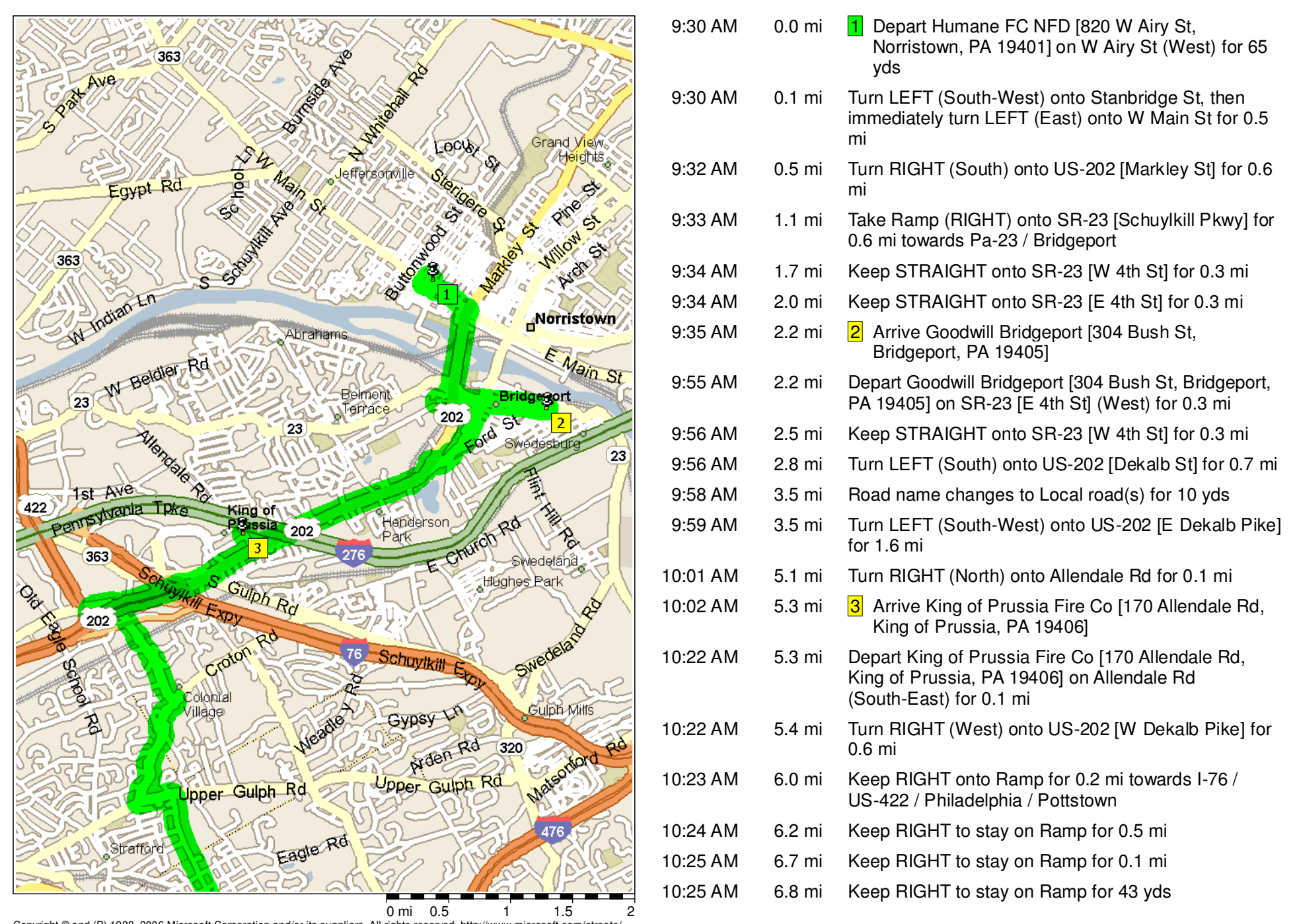
Copyright © and (P) 1988–2006 Microsoft Corporation and/or its suppliers. All rights reserved. http://www.microsoft.com/streets/ Portions © 1990–2006 InstallShield Software Corporation. All rights reserved. Certain mapping and direction data © 2005 NAVTEQ. All rights reserved. The Data for areas of Canada includes information taken with permission from Canadian authorities, including: © Her Majesty the Queen in Right of Canada, © Queen's Printer for Ontario. NAVTEQ and NAVTEQ on BOARD are trademarks of NAVTEQ. © 2005 Tele Atlas North America, Inc. All rights reserved. Tele Atlas and Tele Atlas and Tele Atlas and Tele Atlas north America are trademarks of Tele Atlas. Inc.